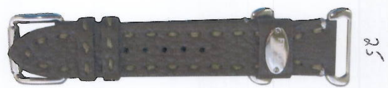
ROSE SS18RD7S $125 GRIGIO SS18REGS $125