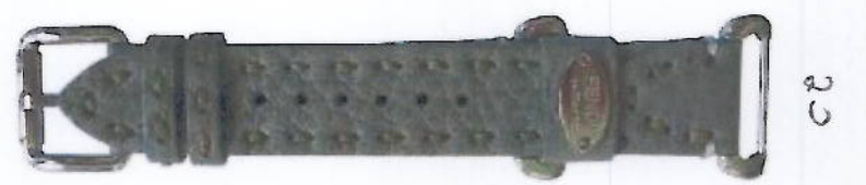
TORTORA SS18RD6S $125