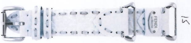
WHITE SS18R04S $125