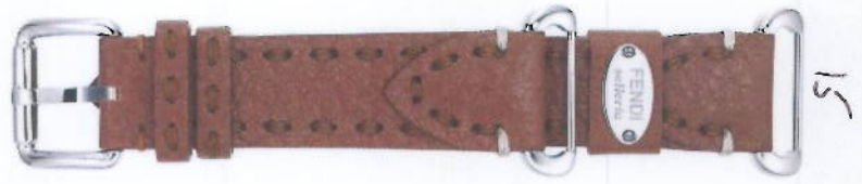
COCOA SS18RC2S $125