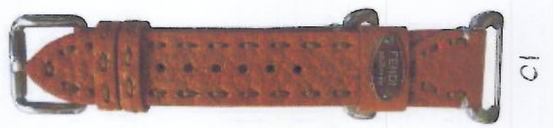
ORANGE SS18RB9S $125